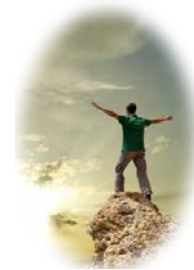
A Taste of Tai Chi